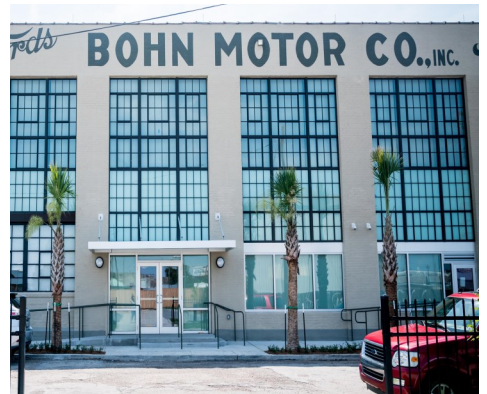
Bohn Motor Co.