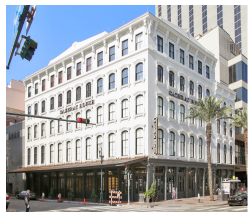
The Sazerac House