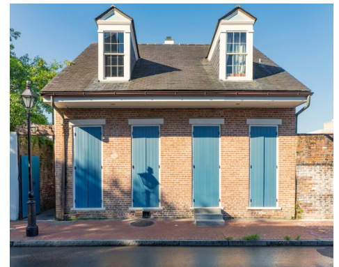
Jewel of the South