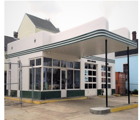
Texaco Service Station