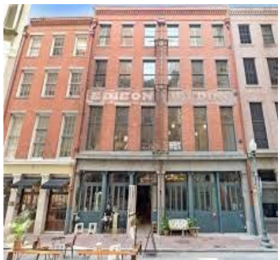
614 Gravier Street