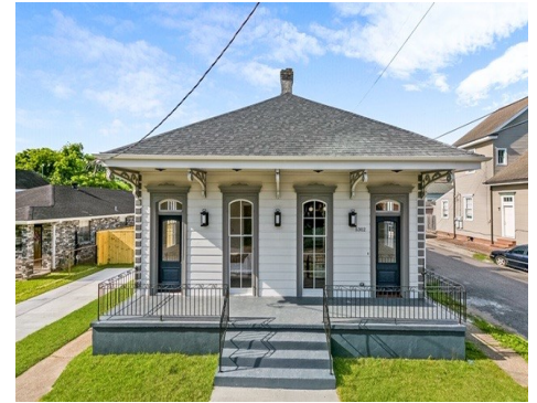
5302 Dauphine Street