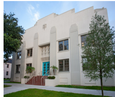
131 S. Jefferson Davis Pkwy.