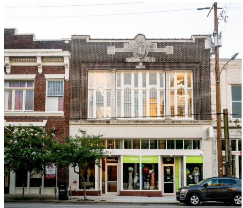
1626 Oretha Castle Haley Boulevard