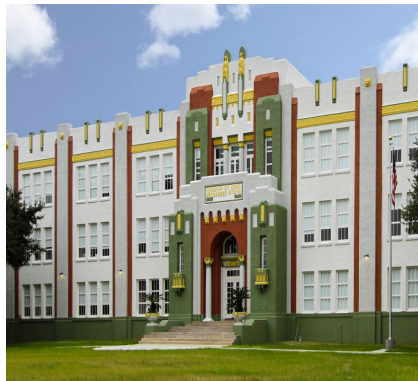
Eleanor McMain High School