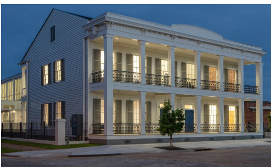
Convent Building - St. Michael Special School