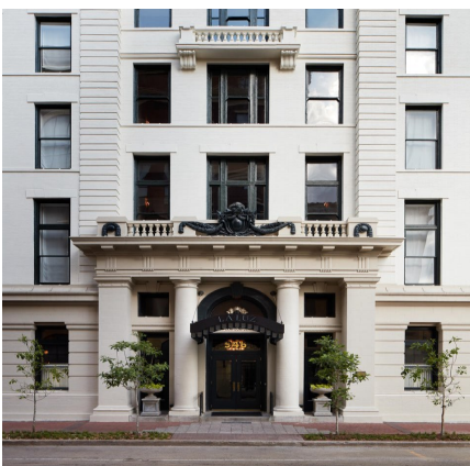
Maison De La Luz