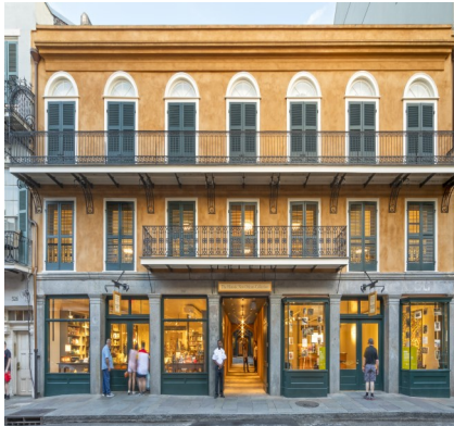
The Seignouret-Brulatour House